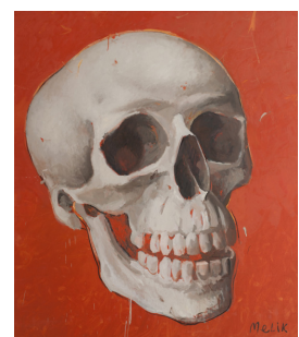
Melik Aghamalov , The Skull , 2011