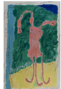
Altai Sadiqzadeh, Persona RR12 , 2011