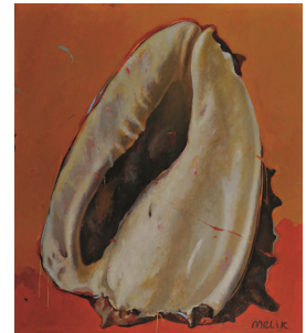
Melik Aghamalov, The Seashell, 2011