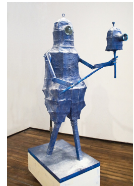
Aga Ousseinov , Diving Lesson , 2010