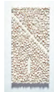
Sergio Camargo, Relief no. 161-4, 1964