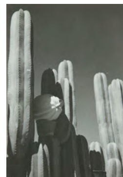
Manuel Alvarez Bravo , Untitled (Cacti against sky) , 1930s – 1940s