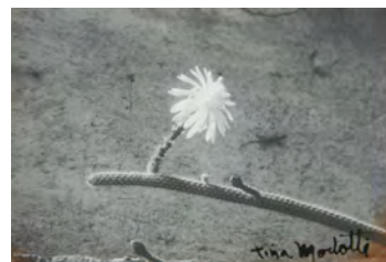
Tina Modotti, Cactus Flower, 1926