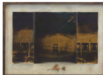
Luis Gonzalez Palma, Lugar sin Reposo, 1991