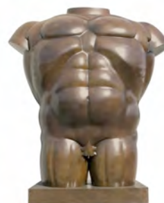
Fernando Botero, Male Torso, 1992