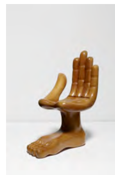
Pedro Friedeberg , "Hand and Foot" chair , 1960s