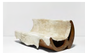
José Zanine Caldas , Bench , ca. 1970