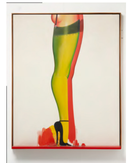
Allen Jones, Soft Tread , 1966-1967