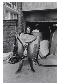
Sarah Lucas, Got a Salmon on in the Street 2 , 2000