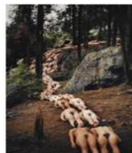
Spencer Tunik, Jerez Moutains , 2001