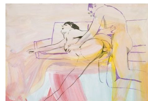
Sigmar Polke, Untitled , 1974