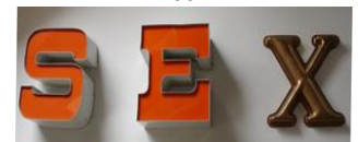
Jack Pierson, SEX , 1992