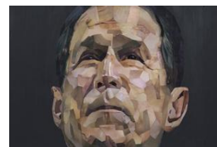
Jonathan Yeo, Bush , 2007